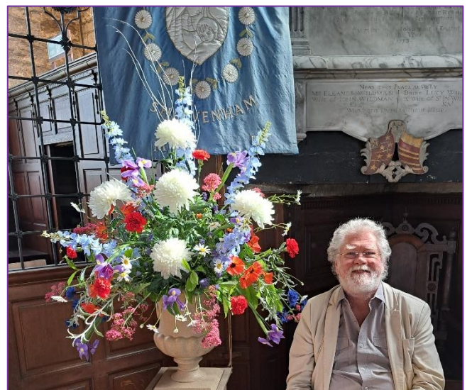
Jubilee Flowers in St Andrew's. A beautiful backdrop for online Matins.