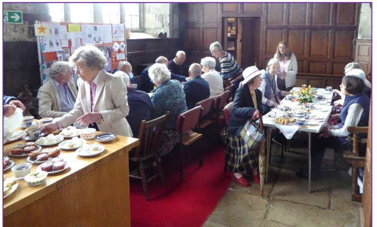
A special celebration for the ASK team and congregation marking both 15 years of ministry in the Benefice as well as Her Majesty's Platinum Jubilee.