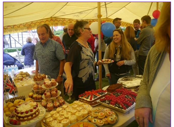
Fernham Village Jubilee Tea