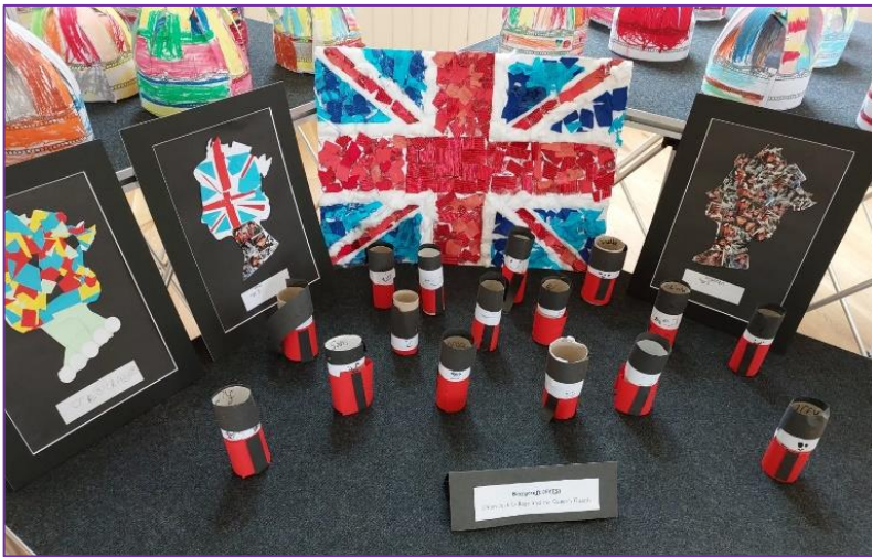
Ashbury School's representation on Trooping the Colour