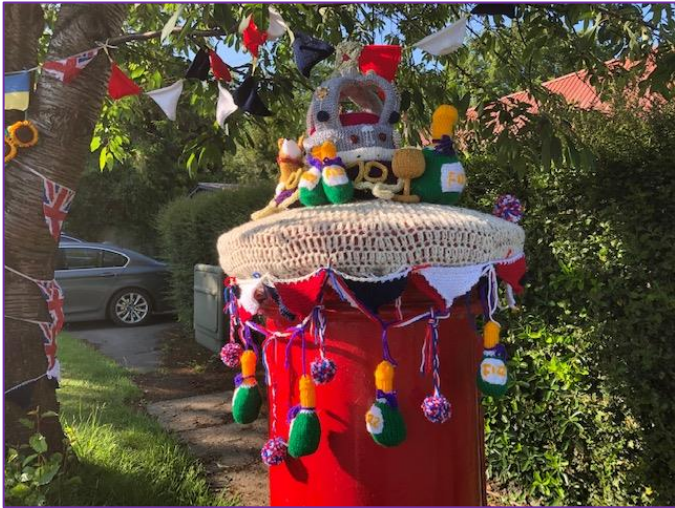
Ashbury Post Box