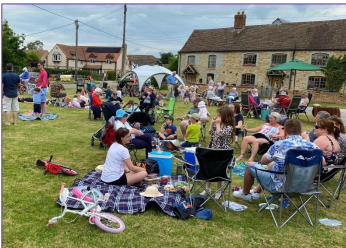
Longcot Jubilee Lunch on The Green