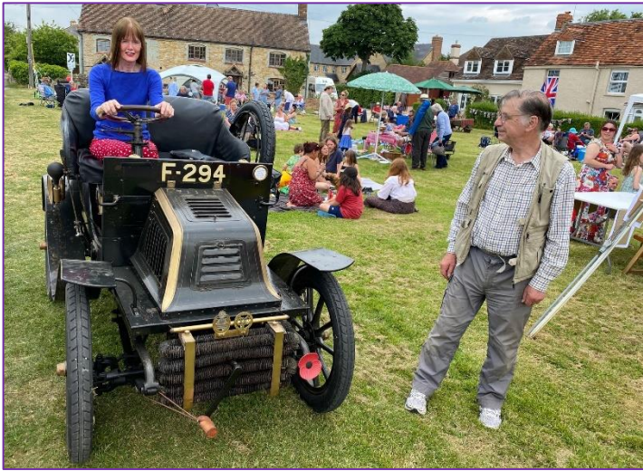
Longcot Jubilee Lunch on The Green