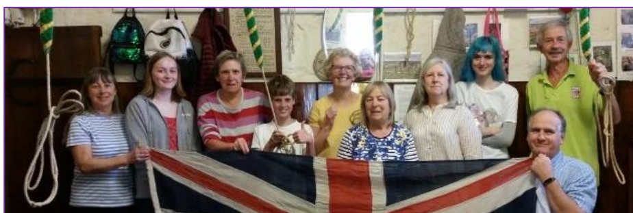
Jubilee Bell ringers at St Andrew's Shrivenham