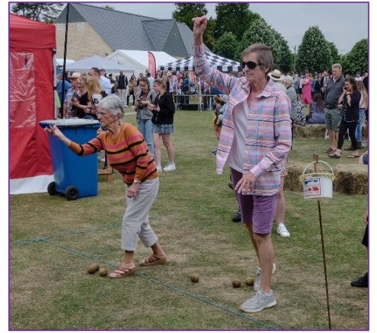
Coconut Shy at Shrivenham Party on the Rec